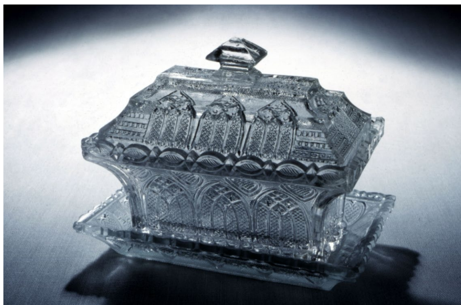
Covered Casket with Tray, 1830-1840 from the Henry Ford

Insurance: No insurance is included, travelers MUST make their own arrangements, particularly medical and repatriation. Also ensure that